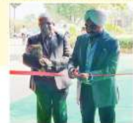
Hotels & Restaurants Association President