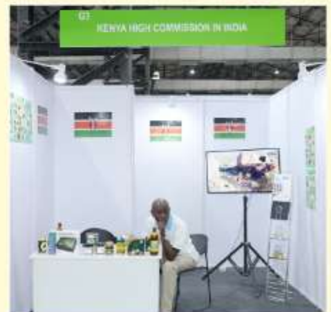
KENYA HIGH COMMISSION