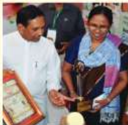
Sri Lankan Minister & Kerala Health Minister