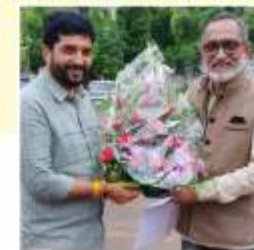
Shri Murlidhar Mohol, Union Minister & Trinity Chairman