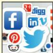
Social Media & Telecom