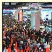
In Venue Displays