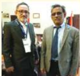
President of Mauritius & CMD of Impex Chamber