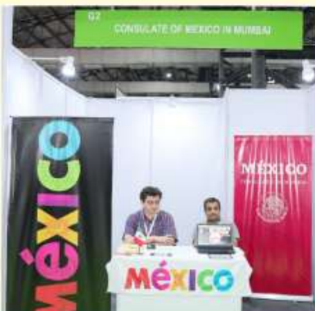
CONSULATE OF MEXICO