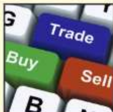
Associations & Chambers