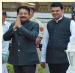
H. E. Governor Rao & CM Fadnavis of Maharashtra