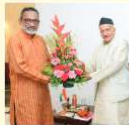
Governor of Maharashtra & Impex Chamber Mg. Dir.