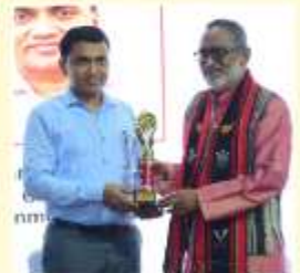
Hon Chief Minister of Goa & Impex Chamber Mg. Dir.