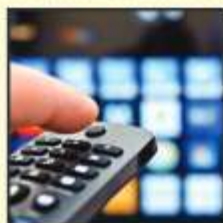
TV & Cable Channels