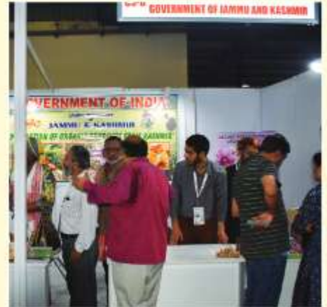
JAMMU & KASHMIR